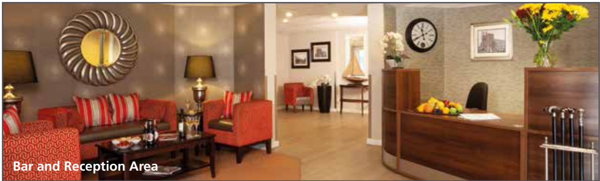
Bar and Reception Area