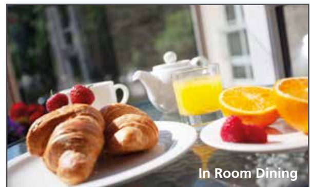
In Room Dining